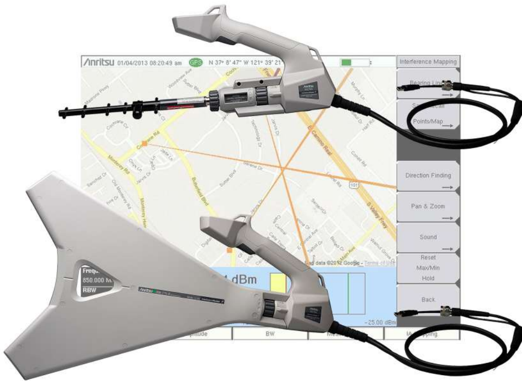
InterferenceHunter™ MA2700A Handheld Direction Finding System Compact Size: 303 mm x 220 mm x 70 mm (11.9 in x 8.7 in x 2.76 in), Lightweight: < 1 kg (2.2 lb)