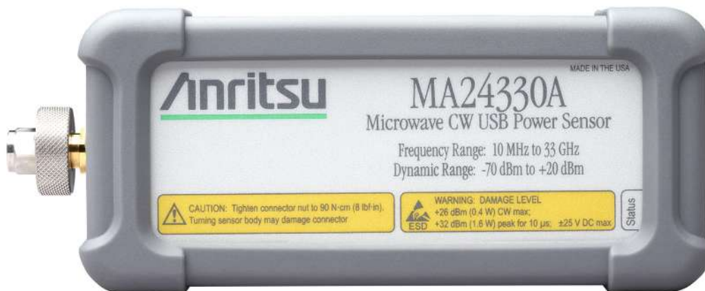
MA243x0A Series Microwave CW USB Power Sensors