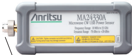
K and V Type connectors designed for use with a torque wrench ensuring repeatable connections