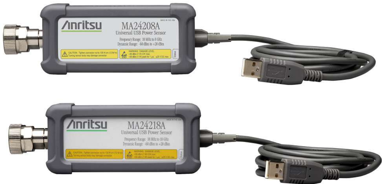
MA24208A and MA24218A Universal USB Power Sensors