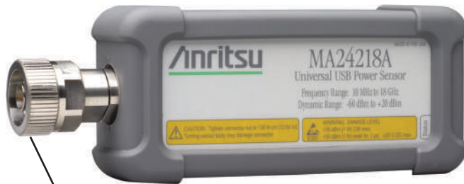
N Type connector designed for use with a torque wrench ensuring repeatable connections