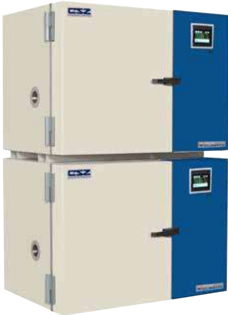
MicroClimate Benchtop Temperature Chamber shown in the stacked position.

These chambers are designed to provide users with a compact chamber for testing small components and products for a variety of industries. Whether you need to perform temperature cycling tests or expose your product to steady state temperature environments, these chambers will maintain precise and accurate temperature/humidity control throughout your test. Choose from benchtop and reach in models to fit your laboratory testing needs.