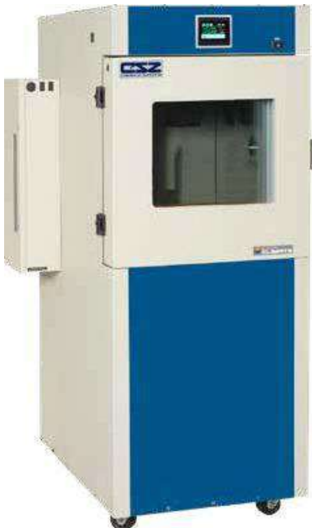
MC-3 shown with optional window and humidity

Optional equipment is economically priced to enhance performance and customize your chamber to meet your needs. A complete selection of optional accessories are available.