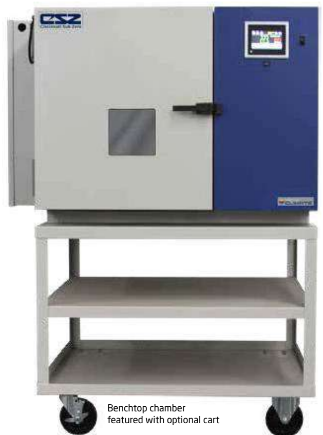
Benchtop chamber featured with optional cart