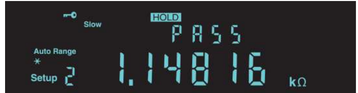
Limit compare mode on the DMM4020.

Dedicated front-panel buttons provide fast access to frequently used functions and parameters, reducing setup time. You no longer need to search through software menus to find the function you need.