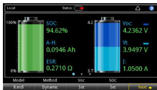
Figure 2. Battery simulator home screen.