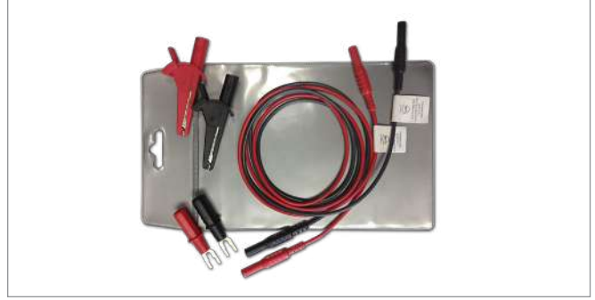
2280-TEST-LEAD: Power Supply Test Lead Kit, 1000 V, 20 A Rating: Contains 122 cm (4 ft) of cable, spade lug adapters, and alligator clips