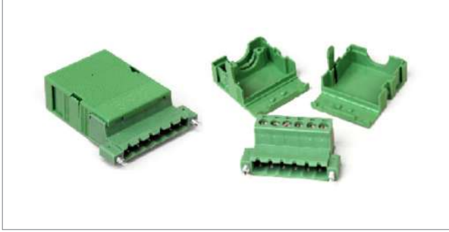
2280-001: Rear Panel Mounting Connector and Cover (assembled view on the left, and connector and top and bottom cover shown separately on the right)