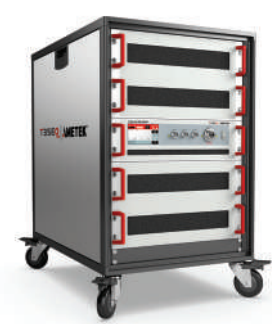
CBA6G-900/600R For ISO 11452-X

NSG 4070-SERIES Multifunctional test system