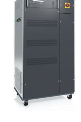
NETWAVE (1PH/3PH) Programmable AC/DC source