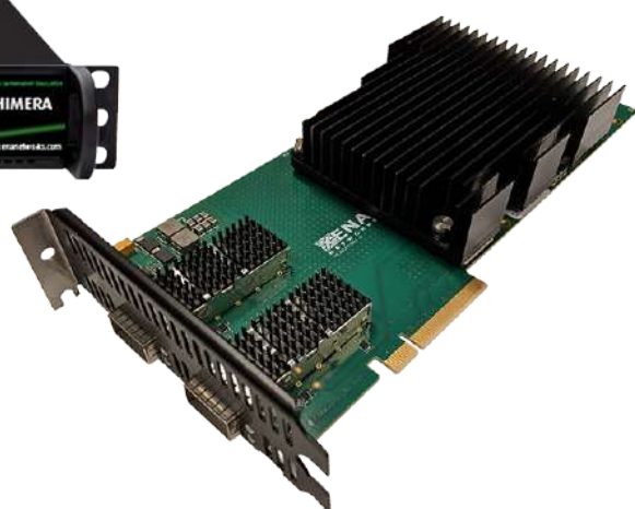
Chimera is available as standalone ChimeraCompact and as a 2-slot test module for the ValkyrieBay