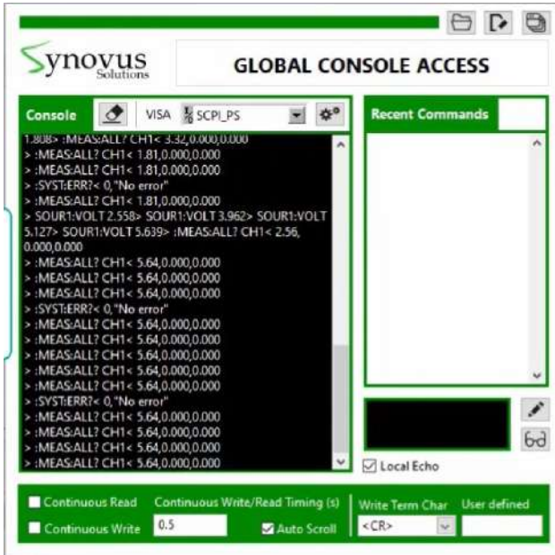
Above: Example of troubleshooting with Simplify Now!™ View messages exchanged with your instruments. Test with confidence that you will always get answers quickly!

Simplify Now!™ is built on more than a decade of successful custom automated test solutions delivered to a broad range of industries: