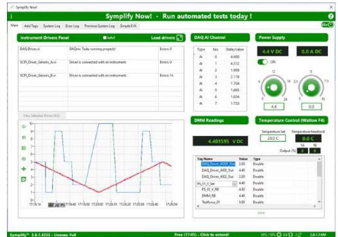
Above: Sample user interface for controlling Tektronix DMM and NI DAQ

Most benchtop instruments (SCPI) and NI DAQ devices are supported. Industrial communication protocols (Modbus, CANOpen, etc.) are available as options.