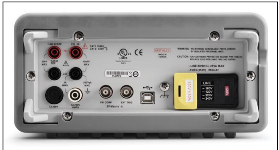
Model 2100 rear panel