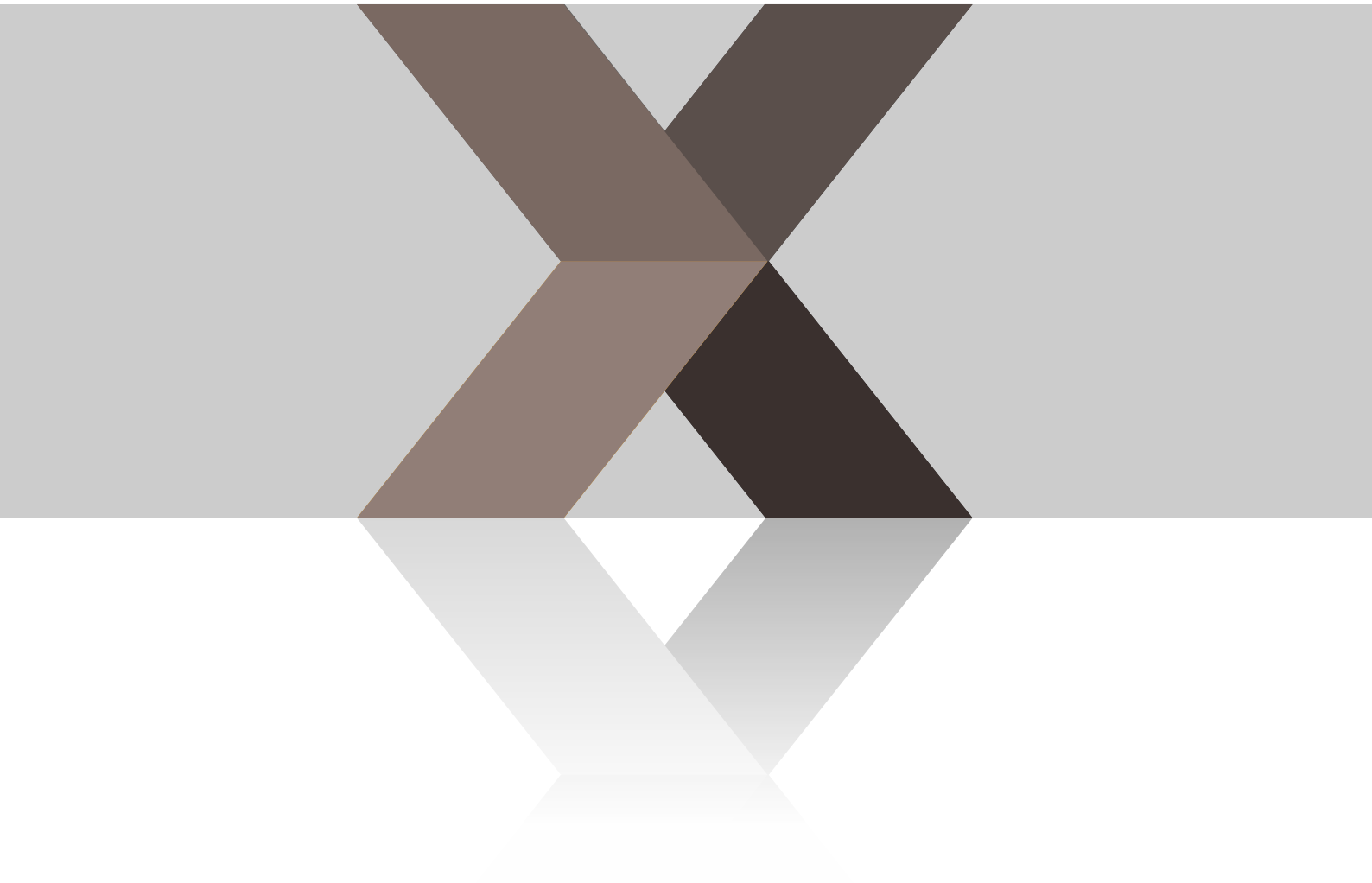
Calnex Paragon - x