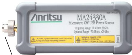
K and V Type connectors designed for use with a torque wrench ensuring repeatable connections