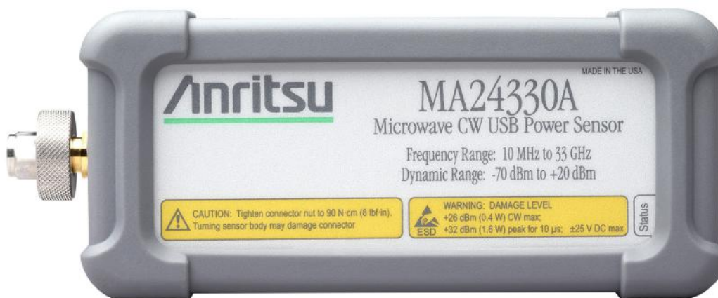
MA243x0A Series Microwave CW USB Power Sensors