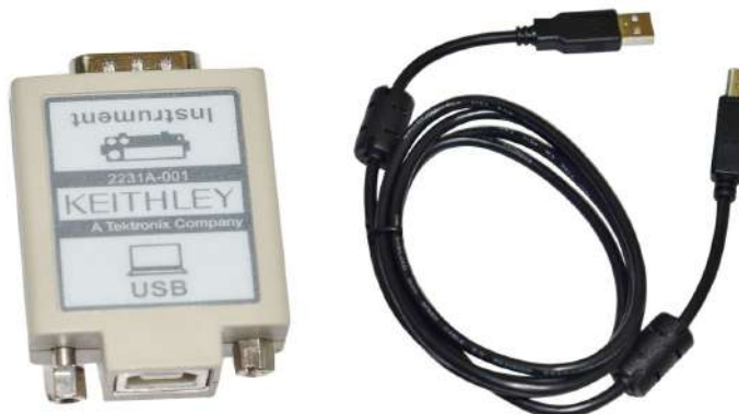
Figure 1: Model 2231A-001 USB Adapter

To set up the remote communication through the Model 2231A-001, configure the computer as follows: